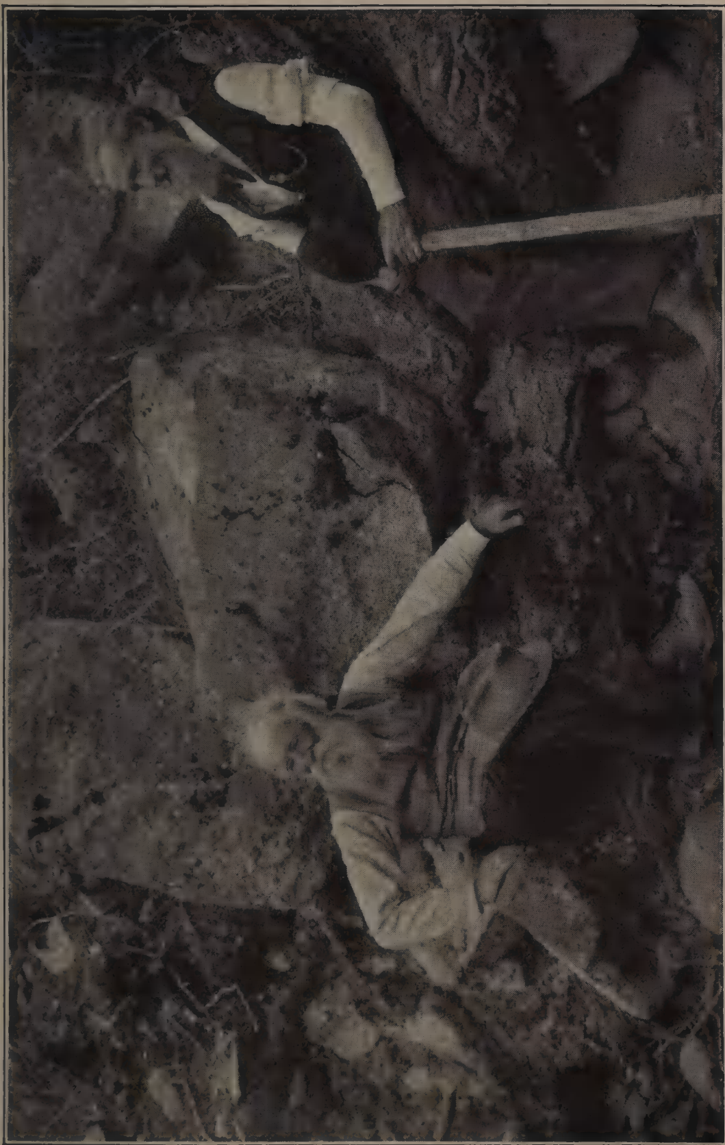
JOHN BURROUGHS AND JOHN MUIR IN THE YOSEMITE